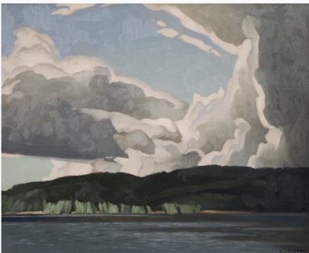
Storm Clouds, Algonquin Park, 1963

Influenced by Franklin Carmichael, he joined the Group of Seven in 1926 and co-founded the Canadian Society of Painters in Water Colour. Known for his clear colours and limited palette, Casson contributed significantly to the Canadian art scene.