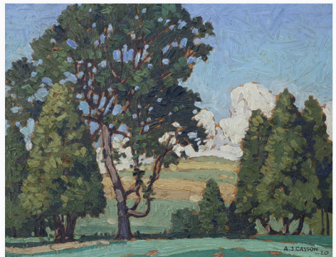
In the Don Valley, 1920