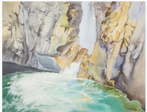
The Pool at Johnson's Canyon, 1954