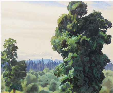
Maples, Sidney, BC, 1946