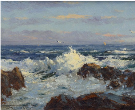
Sun's Last Kiss, c 1890