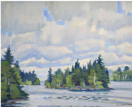
Prospect Lake, Muskoka, c 1935 Oil on board 10.5 x 13.75 in