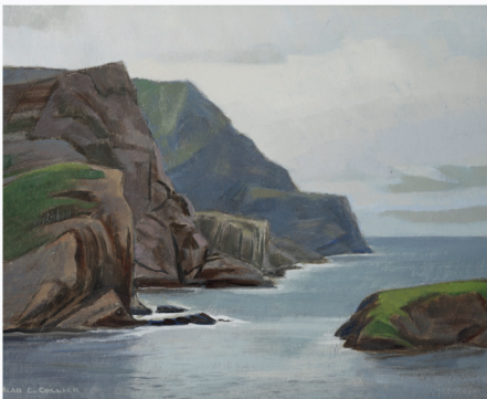
Bottle Cove, Bay of Islands, NL, 1989 Oil on board 12 x 16 in