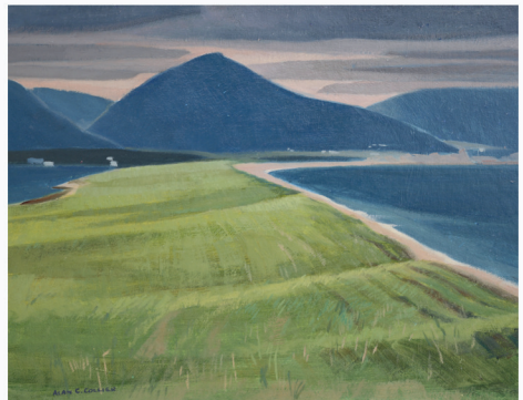
Dingwall, Cape Breton Island, NS, 1983 Oil on board 12 x 16 in