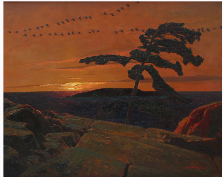
Rocky Belvedere, Georgian Bay