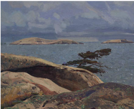
Approaching Storm, Midway Island

Comfort's art captured Canada's essence with vibrancy and emotion. He was also an influential educator and administrator, serving as director of the National Gallery of Canada and promoting Canadian art worldwide. His legacy lives on in major art collections and galleries throughout Canada, leaving a lasting imprint on the country's cultural landscape.