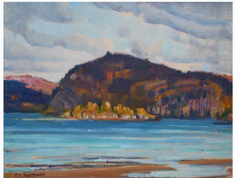
Papineau Lake Oil on canvas board 10.5 x 13.8 in