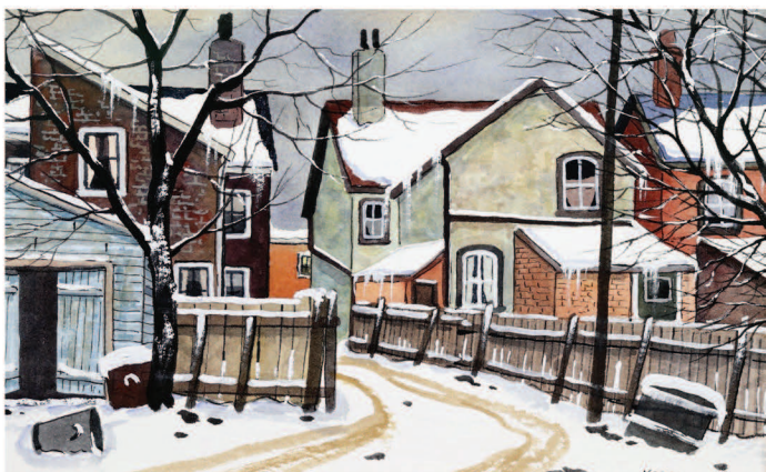
Lane Off McCaul St. c.1980 Watercolour on paper 5.5 x 8.5 in

Kasyn masterfully captures the essence of back-alley city life using a distinctive style that portrays the daily routines and unseen life of ordinary people with authenticity and humanity. His delicate yet deliberate brushstrokes capture the charm of the urban backspace evoking the serene coldness, now a nostalgic snapshot, immortalizing the unique architectural and seasonal characteristics of Toronto during that era.