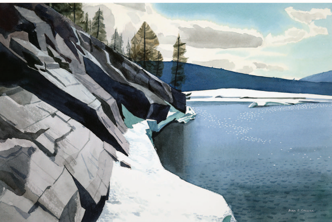
Athabasca River at Old Fort Point, AB 1982 Watercolour on paper 14 x 23 in