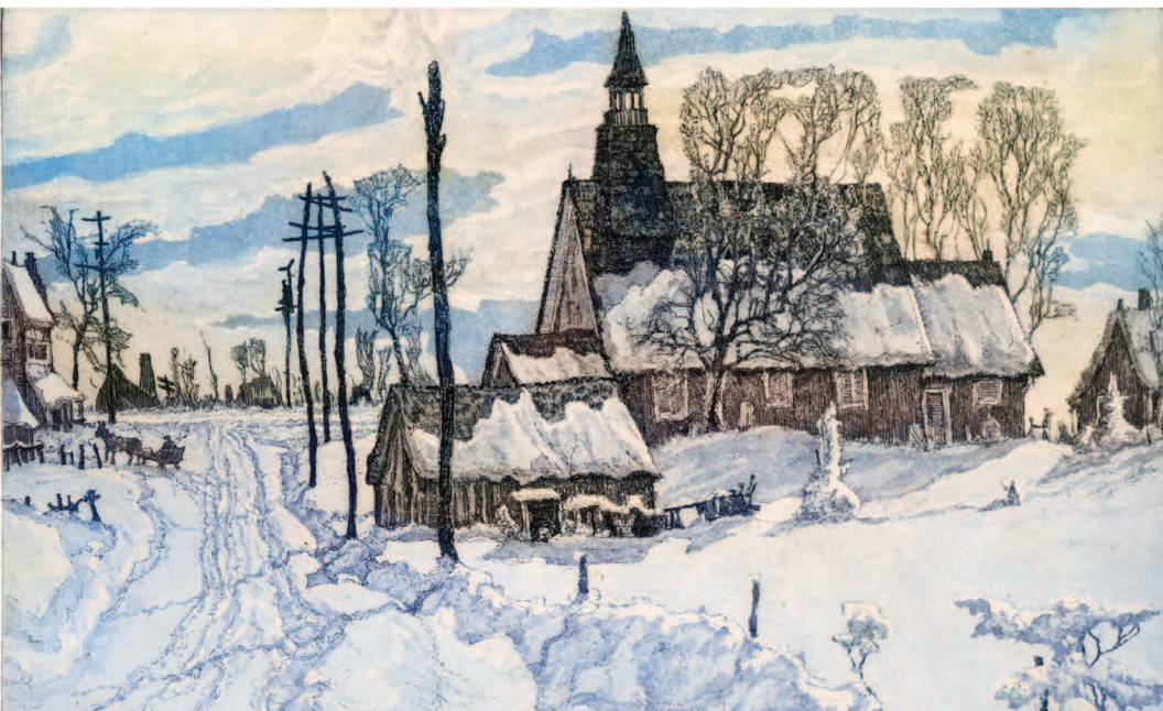
December Sunday Aquatint on paper 5.5 x 7 in