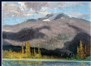
Algonquin Park by J.W. Beatty

The art exhibition, Canada: Wild and Free represents a captivating collection of historical Canadian paintings, celebrating untamed landscapes that reflect the nation’s wild and free spirit. Showcasing masterpieces from renowned Canadian artists, each canvas narrates a visual story of Canada’s rugged beauty—vast wilderness, majestic mountains, and expansive lakes.