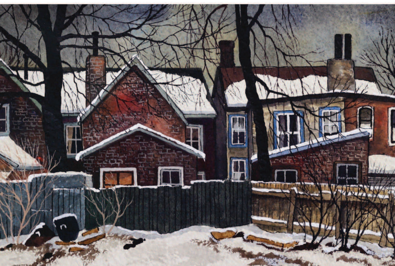
Winter Clouds Over Baldwin Street 1975 Watercolour on paper 7 x 11 in

Kasyn masterfully captures the essence of back-alley city life using a distinctive style that portrays the daily routines and unseen life of ordinary people with authenticity and humanity. His delicate yet deliberate brushstrokes capture the charm of the urban backspace evoking the serene coldness, now a nostalgic snapshot, immortalizing the unique architectural and seasonal characteristics of Toronto during that era.