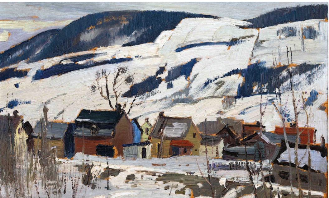
Late March, Charlevoix County 1950 Oil on board 12 x 16 in